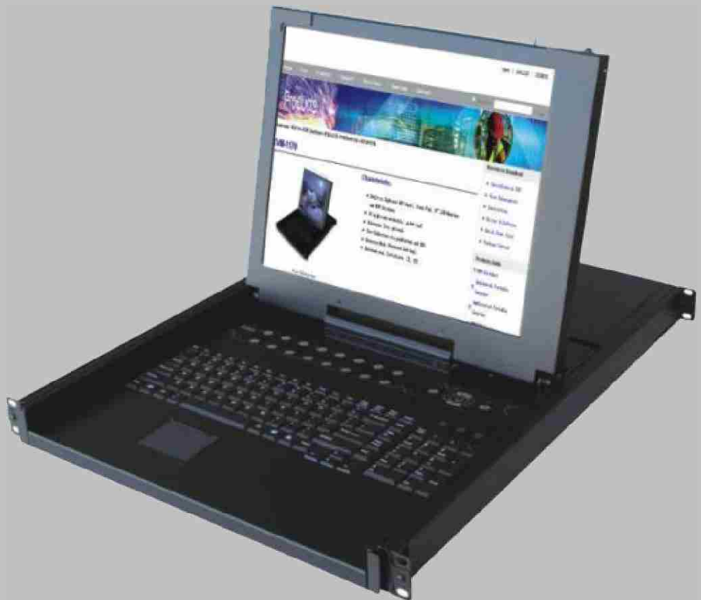
1U Rack-mountable LCD Drawer (KVM)